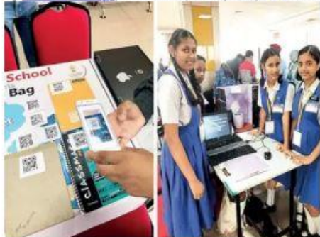
(L) City Pride School students scan QR codes on books with the app to pack the books according to the timetable. (R) Four girls from Pune Police Public School made a urea detector to ensure cleaner toilets Students addressed a range of problems, from packing bags to cleaner toilets through technology