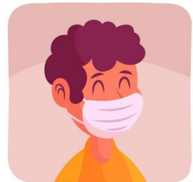
Wear a cloth face mask