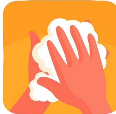
Wash hands often with soap and water

• Two nurses will be on campus and will call up the parent if a student exhibits any symptoms. They will have the emergency numbers of the parents.