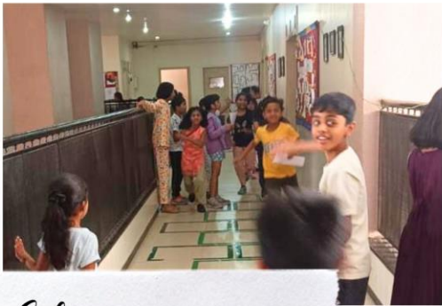
Pajama Party Extravaganza