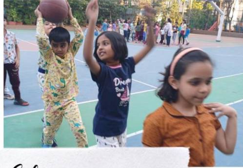
Pajama Party Extravaganza